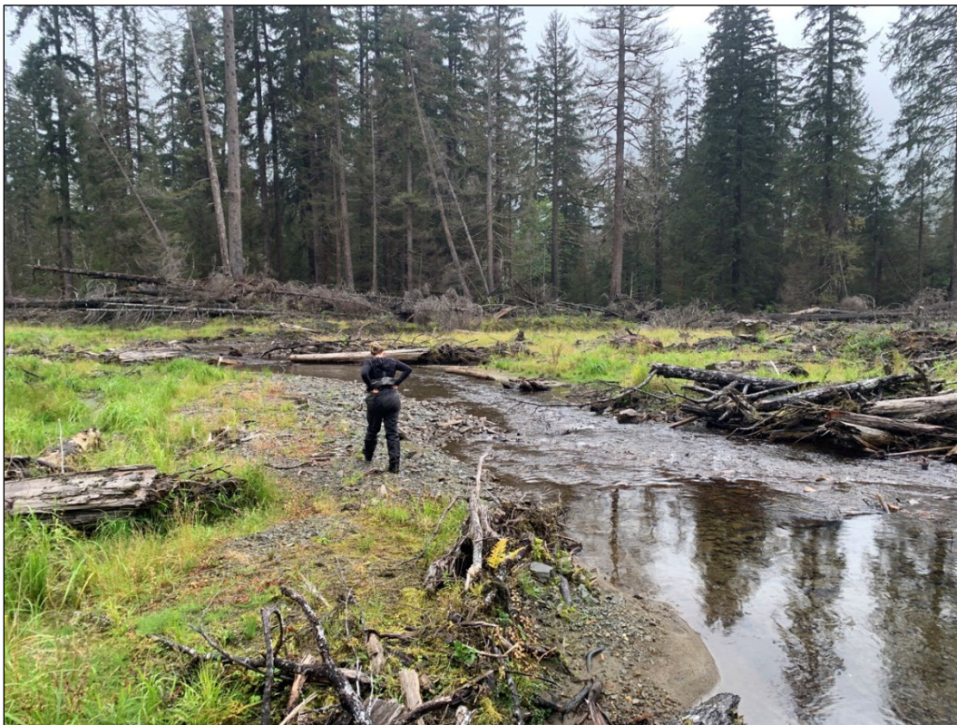
Figure 2.—Newly formed/navigated channel at waypoint 1842.