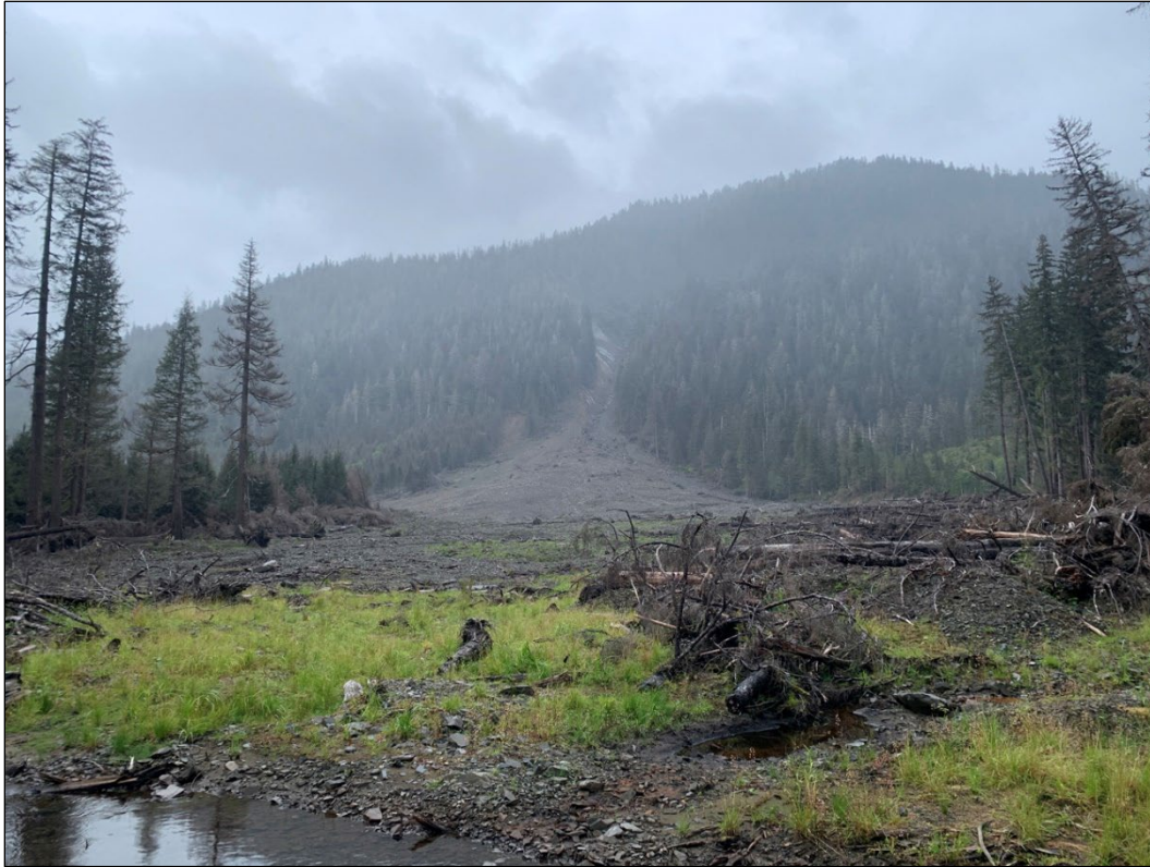
Figure 1.—View of landslide from waypoint 1842.