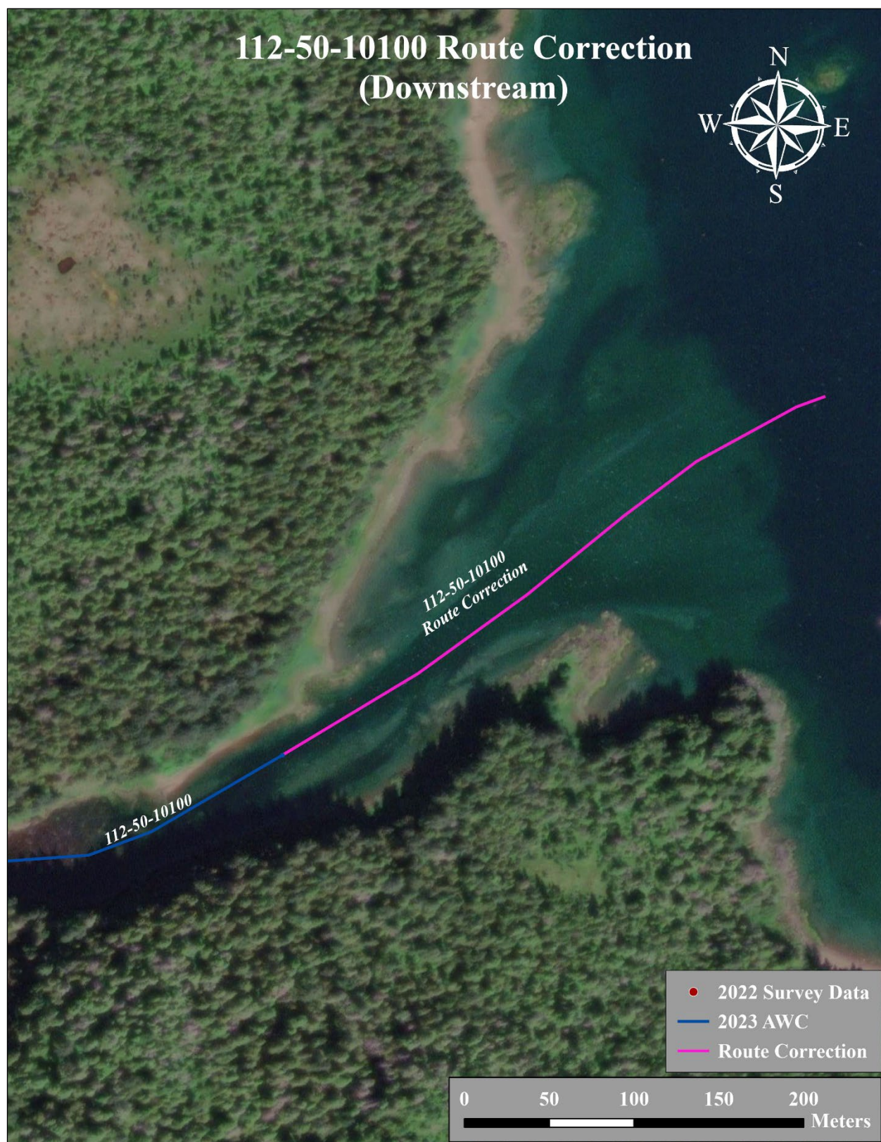
Figure 4.—112-50-10100 route correction (downstream) map.